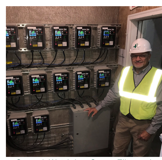
Several Watchdog Super Elite and Flex-Net Industrial Ethernet Systems installed in a facility control room

The company was using at least six different manufacturers of hazard monitoring systems in their facilities, so they had familiarity with a range of available vendors. After extensive research, consultation and analysis, the company selected 4B Components Ltd. as the vendor of choice. The innovative and high quality 4B solutions deployed were: sensors for conveyor speed, bearing temperature, belt alignment, plug condition, slack chain and gate position; Watchdog Super Elite hazard monitor controllers for local control and rapid deployment; Flex-Net System Industrial Ethernet Nodes for remote sensor connectivity; HazardMon.com for cloud monitoring; and testing tools for 100% functional testing and verifiability of sensors and controllers. In addition to providing electronic hardware, 4B toured every facility to assess existing systems and recommend upgrades to ensure successful monitoring, 4B inspected the installation and commissioned startup of the systems, and 4B provided product training to plant personnel and management.