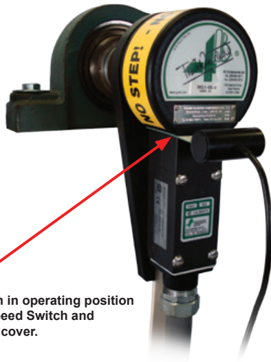
Image A - Pulse Pilot shown in operating position between M800 Speed Switch and Whirligig® target cover.

The Pulse Pilot fits in the gap between the sensor and cover on the Whirligig® (Image A). The Pulse Pilot will have no effect on the operation of the speed switch until it is connected to the SpeedMaster™ and set to "output" mode.