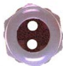
M25 Gland for 2xØ 4,5-7mm