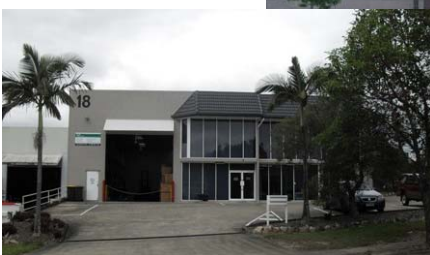
4B Australia office in Acacia Ridge, Brisbane