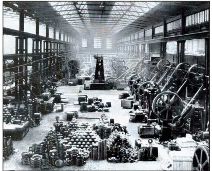
A general view of the press shop in the early 1920s.

The 1950's also saw the incorporation of the firm into T.F. & J.H. Braime Holdings PLC, which obtained a full quote on the London stock exchange. The company is now listed on the London Aim Market but remains family controlled and managed.