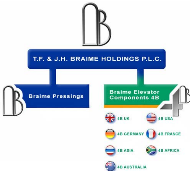
4B USA office in Morton, IL