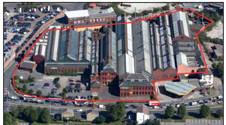
Aerial view of the factory in Leeds, U.K.