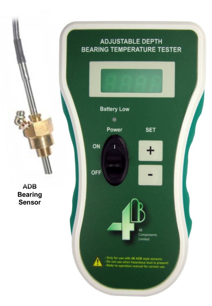
ADB Hand Held Test Unit