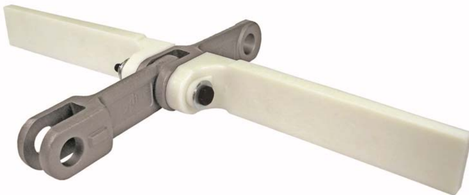
Image of Bolt 'n' Go assembly

With the Bolt 'n' Go system, to conduct repairs such as to change flights or pins can be done inside the conveyor, without even taking the tension out of the chain. Instead of welded flights, we are using bolt on flights, and again these can easily be changed without any fuss.